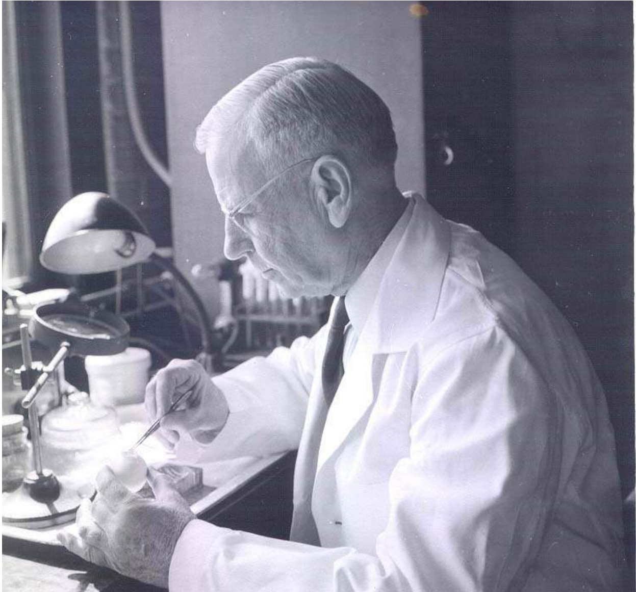
Goodpasture with the egg ca. 1950.

spotted fever, influenza, and equine sleeping sickness, an exceptionally nasty item that in humans killed seventy percent of those stricken.